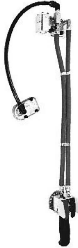
BCS2230 Straight Hose

Up/Down Pendant Control Module for loading and unloading varying weights. The most commonly used control for all balancers.